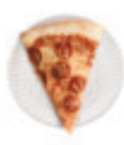
20 years ago