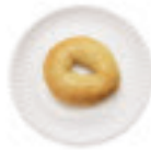
20 years ago